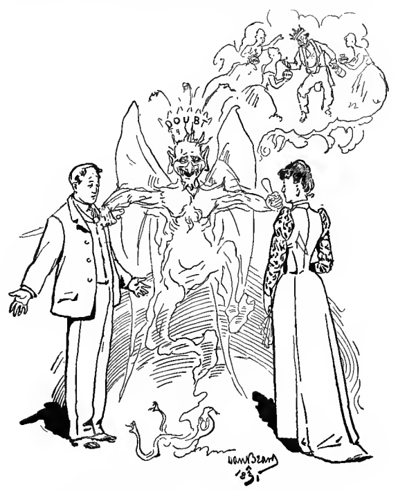
"YOU AN EARL'S SON! SHOW ME THE SIGNS."

"Simply because you didn't speak it earlier!"